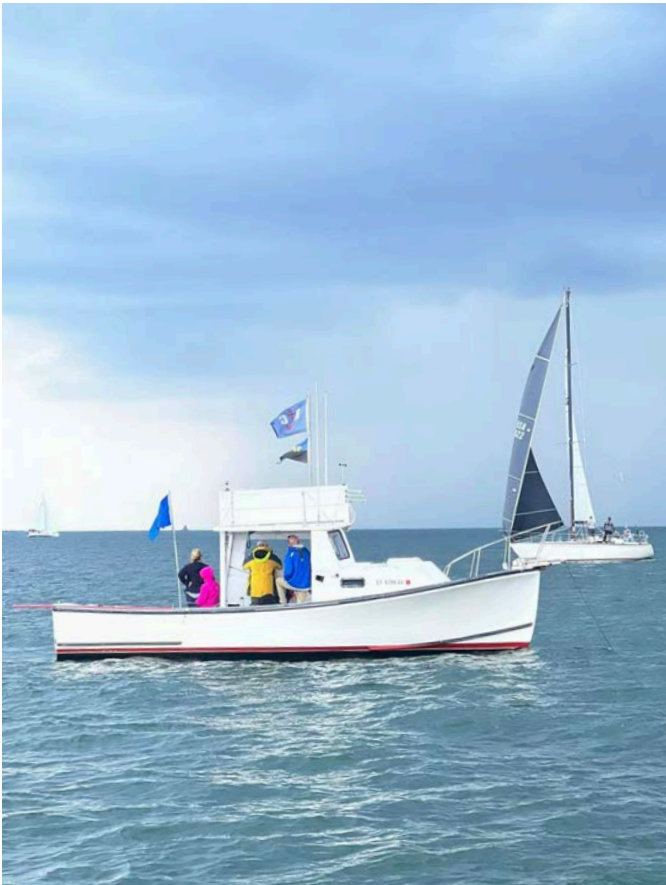
Crews competing in this year's Sails Up 4 Cancer Regatta experienced a full palette of weather conditions.